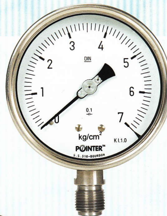
100mm Bottom Mounting