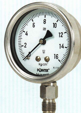
63mm Bottom Mounting