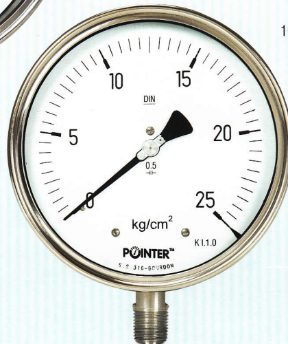
150mm Bottom Mounting